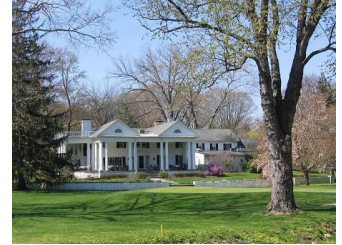
Glenhardie County Club

Glenhardie Country Club is located at 1399 Old Eagle School Road, Wayne PA 19087. Going East on RT 202, get off at Devon exit. Turn right at first light (West Valley Road). Pass the Post Office and then take a left on Deveon