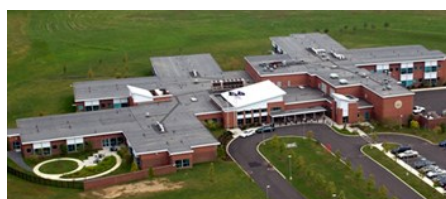
Delaware Valley Veterans Home