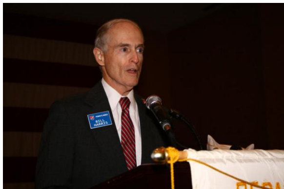
My remarks were short and well received.

A few weeks ago I spoke at the American Legion's state convention in Harrisburg, which I believe is the first time that MOAA has been invited.