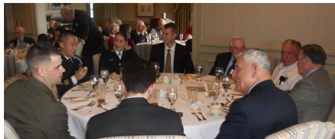
More Attendees at the December Meeting