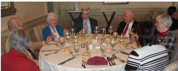
Attendees at the December Members Meeting