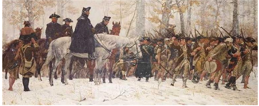
Newsletter of the MOAA Valley Forge Chapter