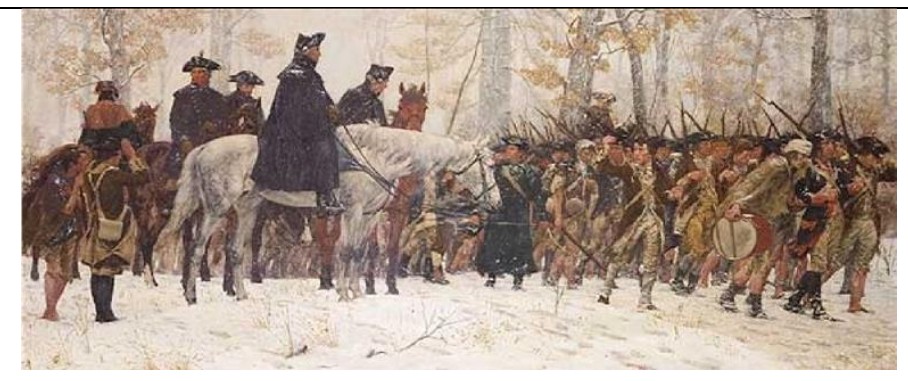
Newsletter of the MOAA Valley Forge Chapter