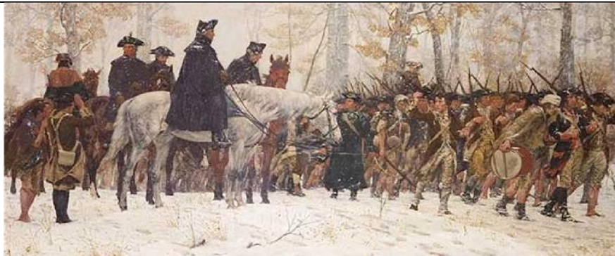
Newsletter of the MOAA Valley Forge Chapter