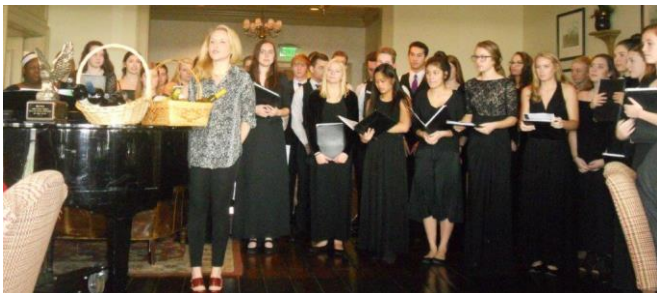
Phoenixville High School Choir providing entertainment at the December General Membership Meeting.