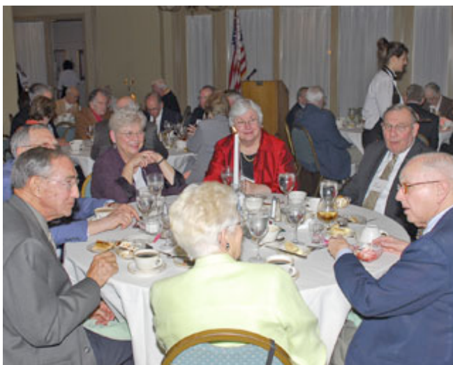
Dinner is Served