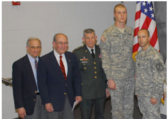
The Long and the Short of It