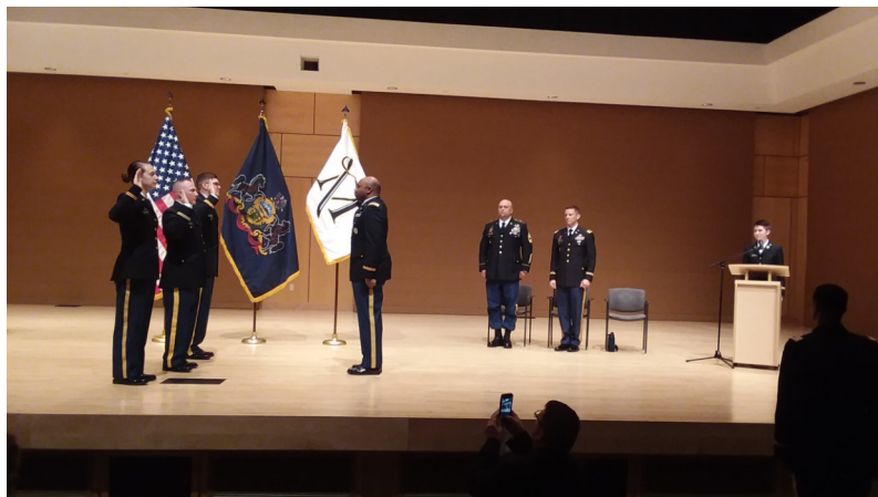
Oath of Office Swearing in Ceremony