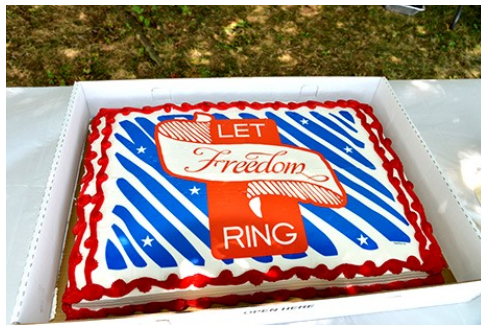
Our cake—Let Freedom Ring

A reminder for our Army members, this annual event is scheduled for Saturday, October 5, 2019, at the Army War College starting with registration at 7:30. Contact the Retirement Services Office at 717 245-4501 for more information.