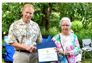
Gareis & Crease