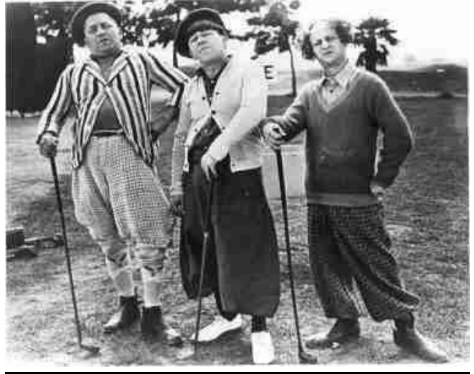
Amazing who you get to meet at MOAA Golf Outings!