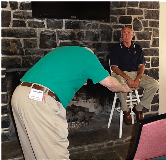
The new protocol for approaching our president?