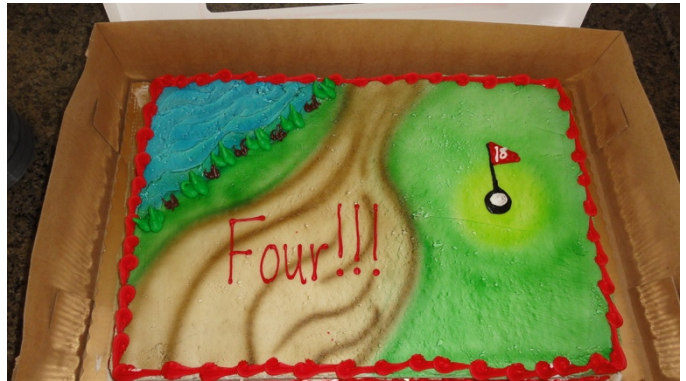
Is this cake cool or what?