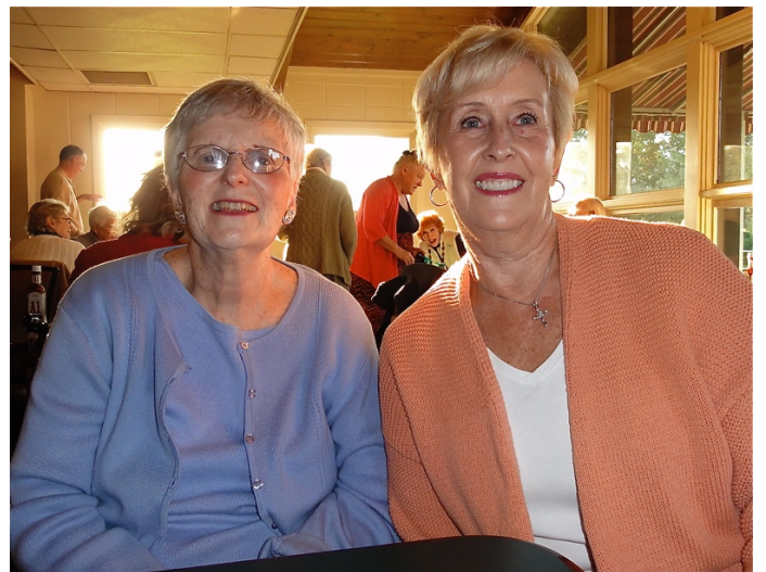
The birthday girls!