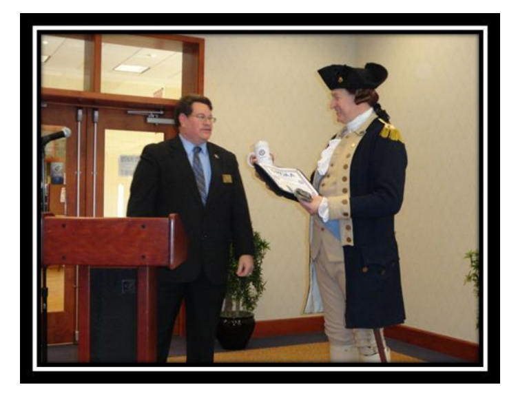
PRESENTATION OF CUSTOM BEER STEIN AND A DONATION TO THE FRIENDS OF WASHINGTON CROSSING STATE PARK