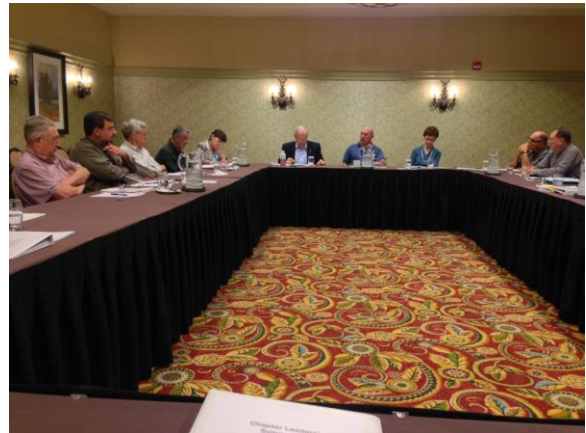
Notes from our state council meeting, held in Hershey on September 26: