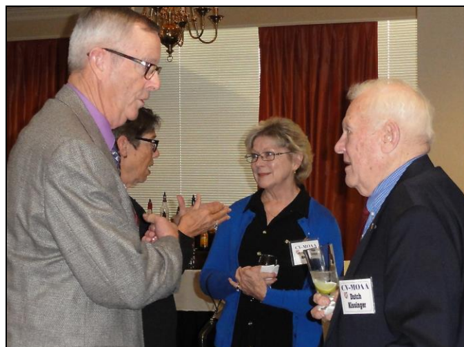
The Harkeys and Kissingers deep in discussion.