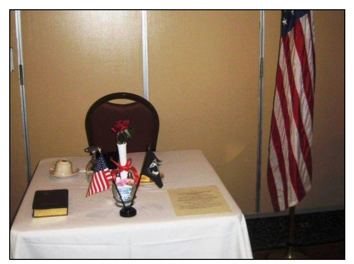
In memory of our missing comrades.