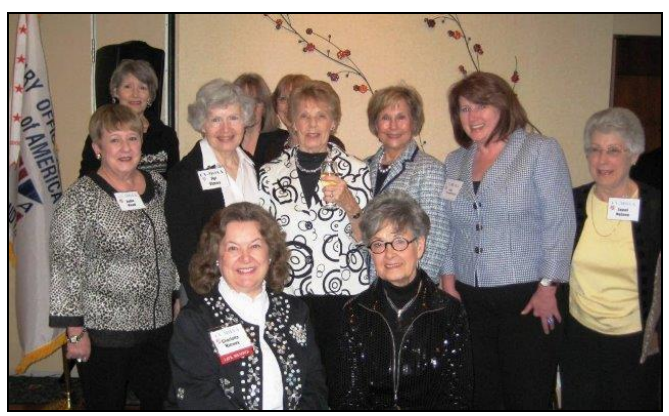
These ladies must have gotten the memo about wearing black and white to the dinner. First, the CCGs (Camel Club Guys), now, the BWLs (Black and White Ladies)!