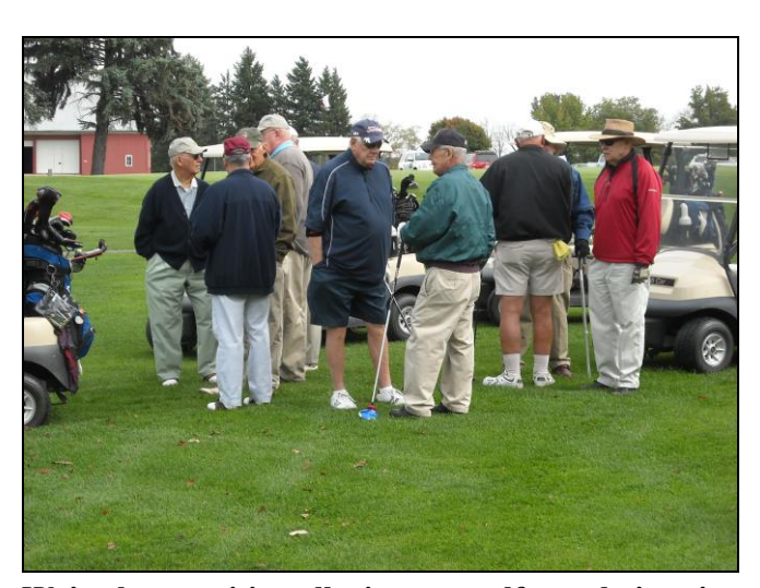
We've been waiting all winter to golf – so, let's go!

In the event of inclement weather, the tournament director will decide whether to hold the tournament. If weather becomes a factor, golfers should call the club house (243-3262) for information to save an unnecessary trip to the golf course. The picnic will be held regard less of the weather.