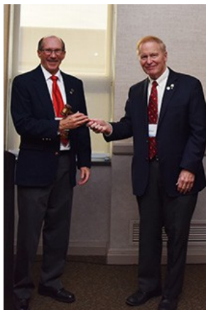
Passing Gavel Shelton-Gareis