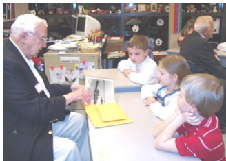
Adopt a Kid/Vet