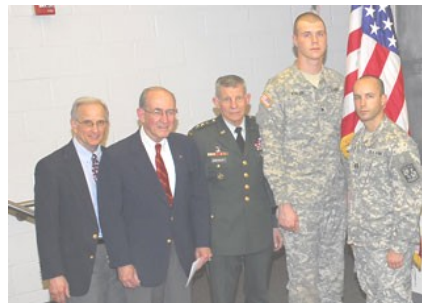
Millersville ROTC Commissioning