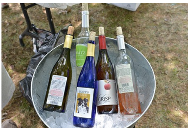
Picnic Waltz Vineyards