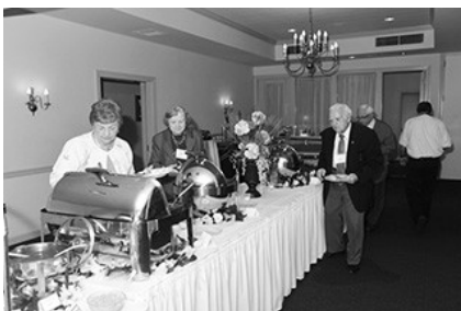
Meadia Heights Buffet