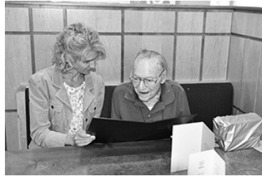
JJ Bentman Award