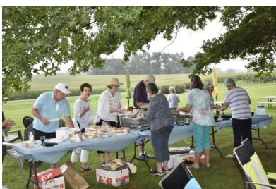
Food is served