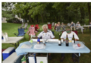
Waltz Wine Samples