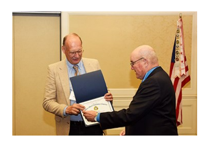
Speaker Certificate: Rapak/Confer