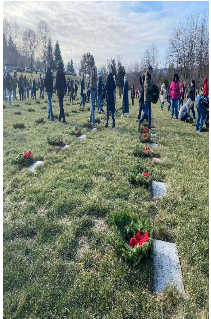
Indiantown Gap National Cemetery

Keystone Capital Chapter continues to honor chapter members each year that have been laid to rest at Indiantown Gap National Cemetery. Wreaths are purchased by the chapter from the PAIGNA sponsor group.